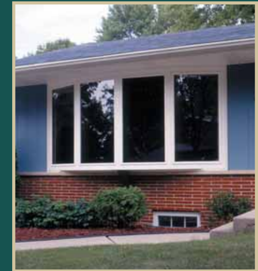
The Alliance Windows Systems casement bay window gives your home a whole new look—beautifying both interior and exterior.