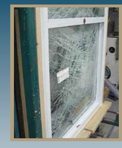
Impacted windows are tested with hurricane-force winds after taking a direct hit from a 9-lb. 2x4, flying at 54 mph.