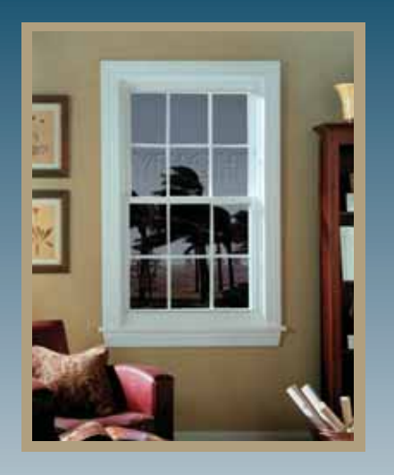
In the event of violent weather, you don't need to do anything with your windows other than to ensure that they're closed and locked.